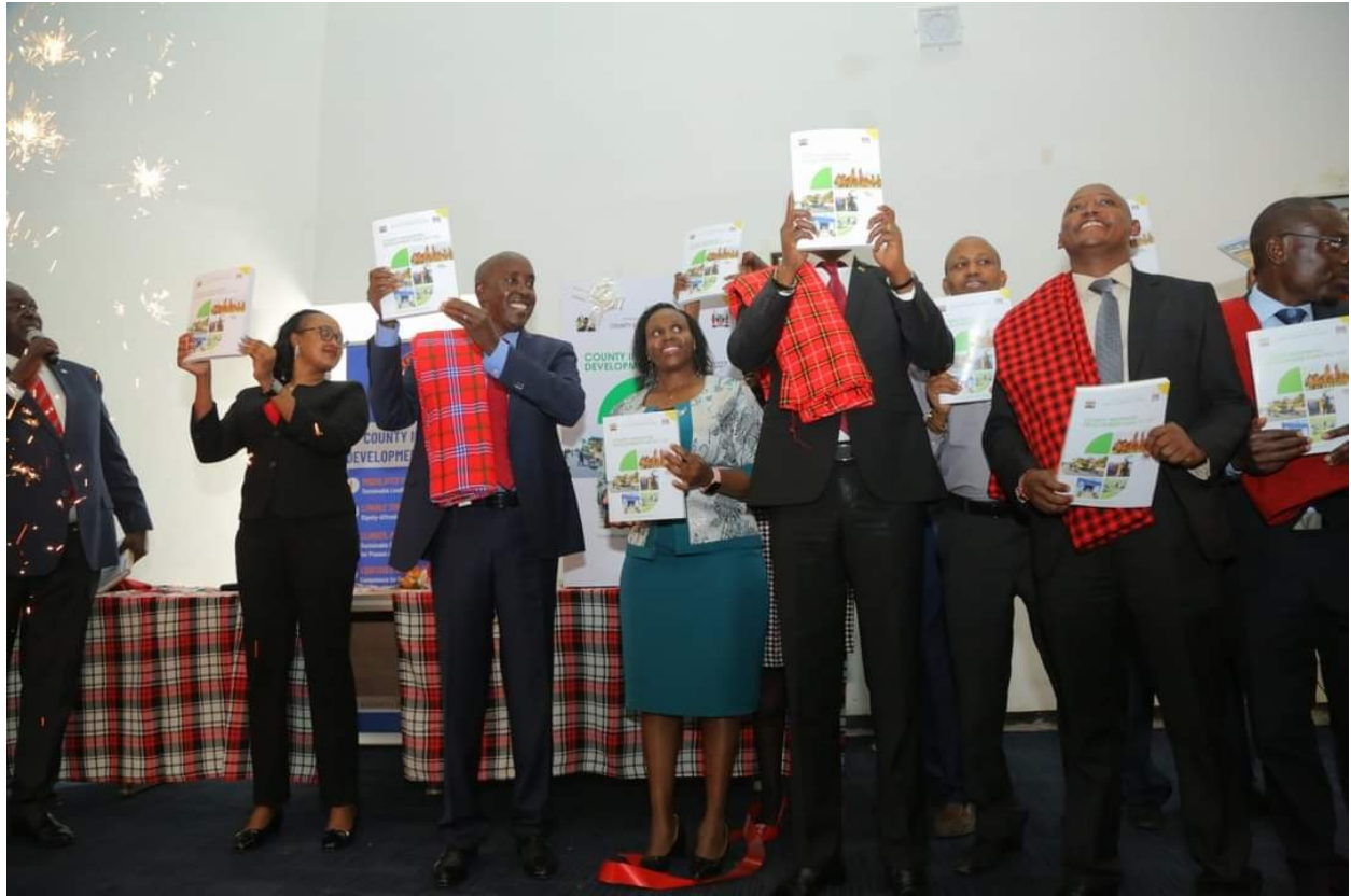
3 rd – Generation CIDP Launch.