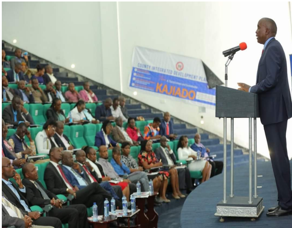
H.E Joseph Ole Lenku Addressing Kajiado Citizens during the launch.