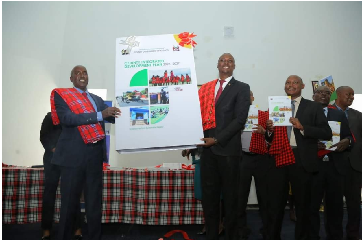
H.E Joseph Ole Lenku and the Deputy Governor unveiling the 3 rd generation CIDP.